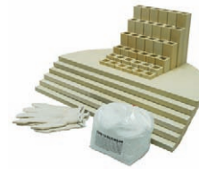
Furniture kit for a J2918-3.

For all Dimensions and Weights: See hotkilns.com/jupiter-dimensions.pdf