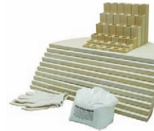
Furniture kit for a J2936-3.