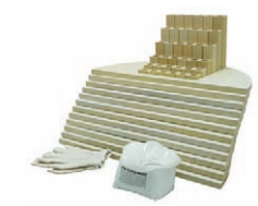
Furniture kit for a J2945-3.