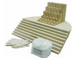
Furniture kit for a J2927-3.